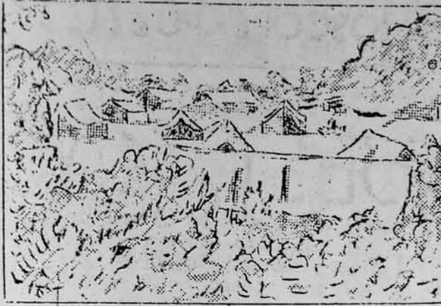
THE TENT CITY